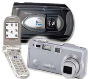
Compadre: Camera works with most digital cameras and cellphones

Part of SpeechGear's Compadre™ suite of instant language translation solutions found at www.speechgear.com/store .